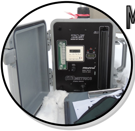
1 of 2 MFN Air Monitors